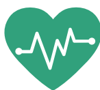
Health & Wellbeing Board