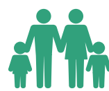
Children & Families